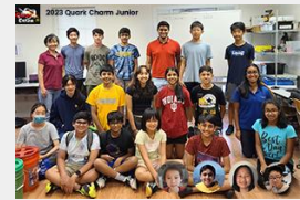
SR Quark Charm Jr won the FIRST PLACE at the 2023 competition